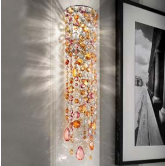
Powder coated metal frame and painted glass pendants or only transparent pendants.