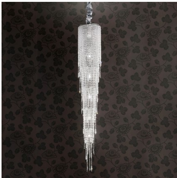
VE 825 S6