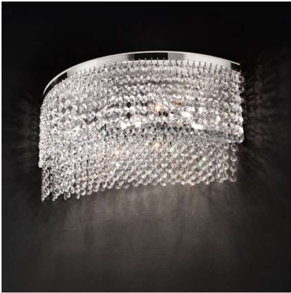
Chrome plated metal frame and crystal pendants.