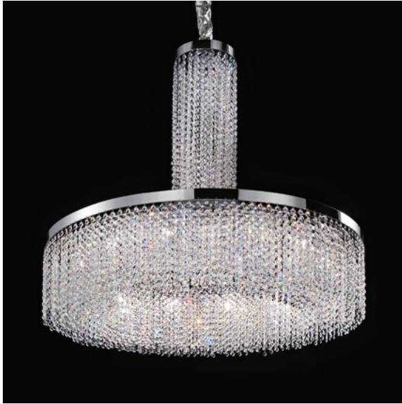
Chrome plated metal frame and crystal pendants.