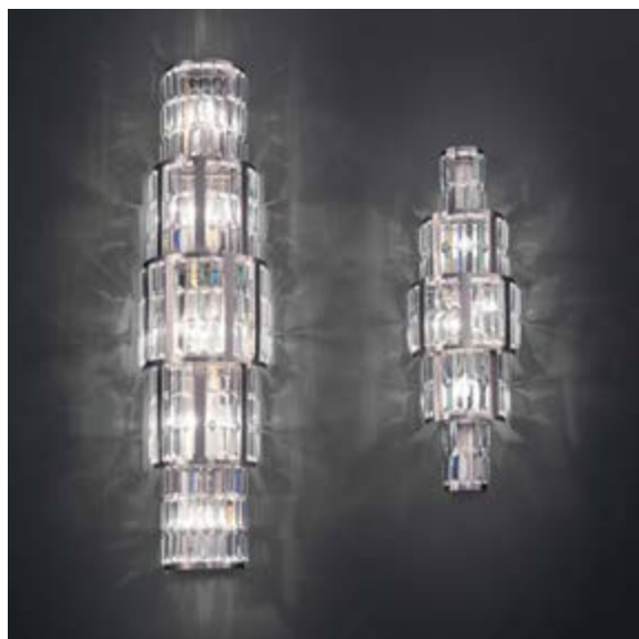
Metal frame and crystal pendants.