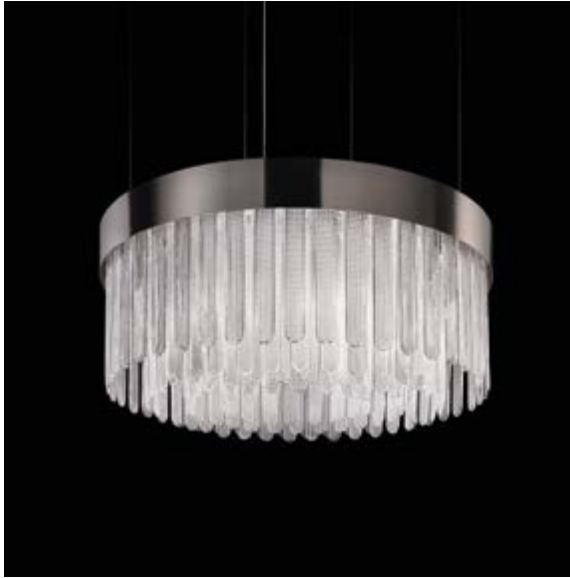
VE 1150 S12