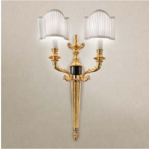
VE 1072 A2