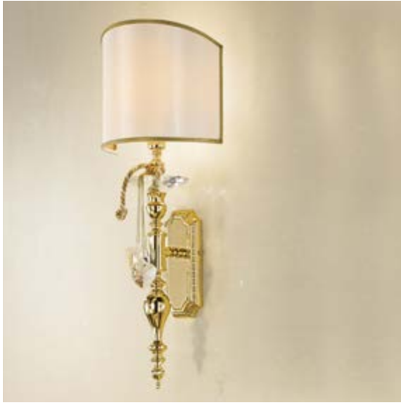
VE 1002 A1